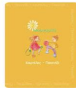
Ε.ΔΙΑ.Μ.ΜΕ - ΠΑΝΕΠΙΣ... Μαργαρίτα 2