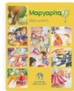
Ε.ΔΙΑ.Μ.ΜΕ - ΠΑΝΕΠ... Μαργαρίτα 2