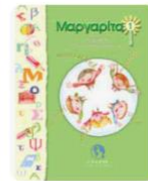
Ε.ΔΙΑ.Μ.ΜΕ - ΠΑΝΕΠ... Μαργαρίτα 1