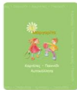
Ε.ΔΙΑ.Μ.ΜΕ - ΠΑΝΕΠΙΣ... Μαργαρίτα 1