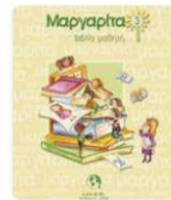
Ε.ΔΙΑ.Μ.ΜΕ - ΠΑΝΕΠΙ... Μαργαρίτα 3